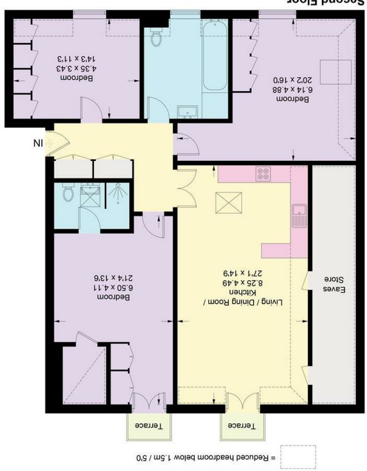
Coombe Lane West, KT2 Approximate Gross Internal Area = 95.8 sq m / 1032 sq ft

This plan is for layout guidance only. Not drawn to scale unless stated. Windows and door openings are approximate. Whilst every care is taken in the preparation of this plan, please check all dimensions, shapes and compass bearings before making any decisions reliant upon them. (ID670522)